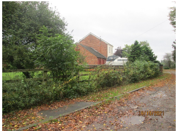
South of the site