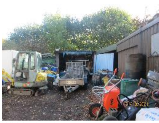
Within the site