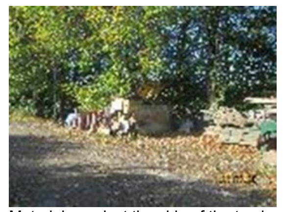
Materials against the side of the track