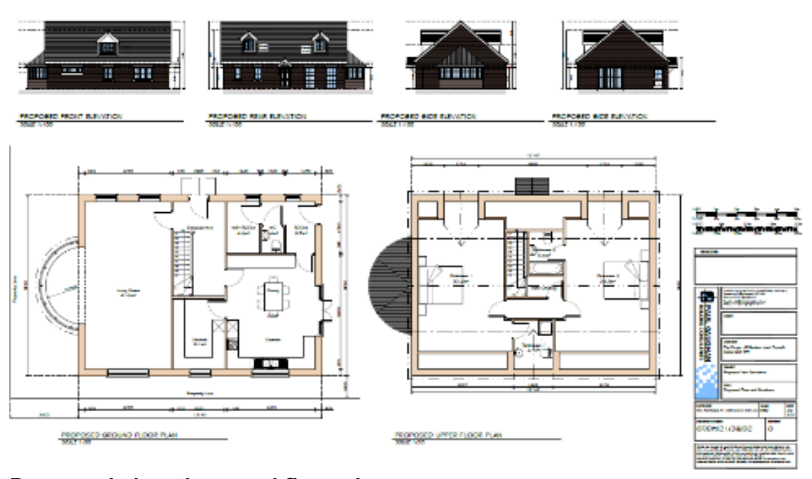
Proposed elevations and floor plans