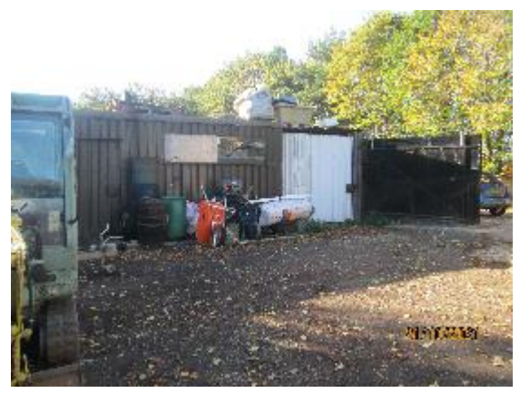
Within the site, facing west