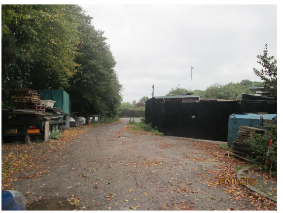
Access to the site