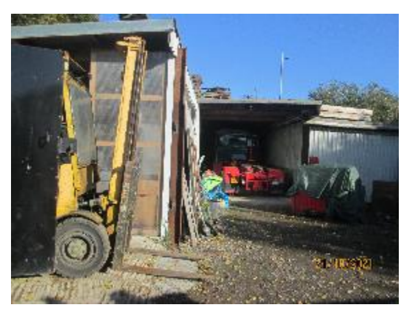
Within the site